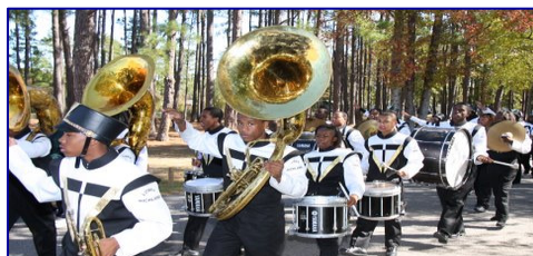
Lower Richland High School Marching Band