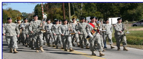
Fort Jackson Army Band