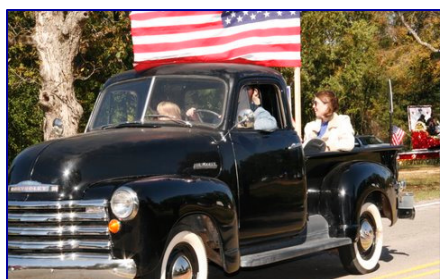
Antique truck: Team 1 Automotive