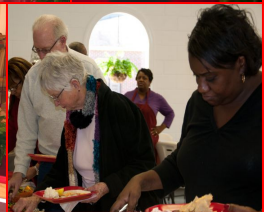
Red Hill Baptist Church - Organized 1868 - Gadsden, SC