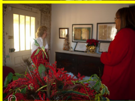
Historic Harriet Barber House Hopkins, SC