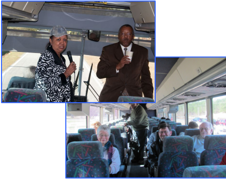
Bus Tour – Off to Historical Sites in Lower Richland Heritage Corridor