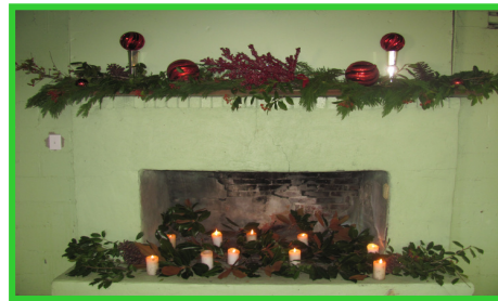
"The Old Hearth" - LR Heritage Museum Historic Village of Hopkins