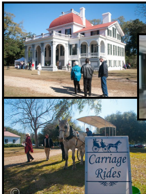
Kensington Mansion Eastover, SC