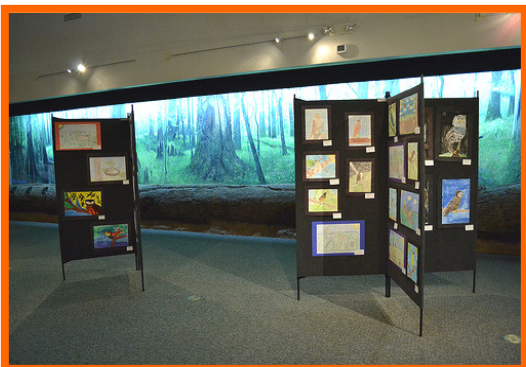
Student Art - Congaree National Park