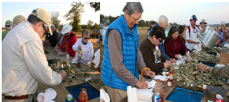
Friends of Congaree Swamp Enjoy Oyster Roast.