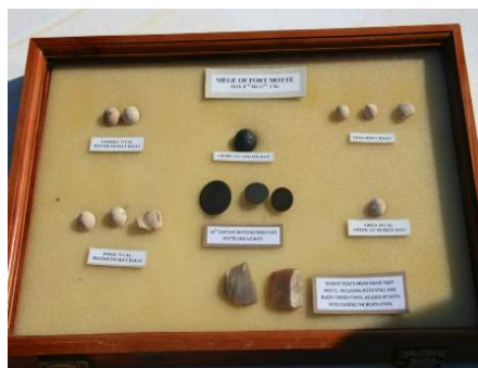
Musket Balls & Other Artifacts Recovered from Site.