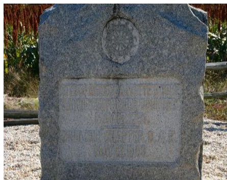
Stone Marker Indicates Location of Rebecca Motte's House.