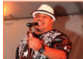
Carlos Santana and Band

Tickets: $25.00 Advance / $30.00 At the Door