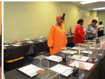
Inventions by African Americans -by Audrey Smalls