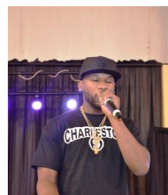
Welter-Weight Champion Sammie "Da Bully" Millhouse