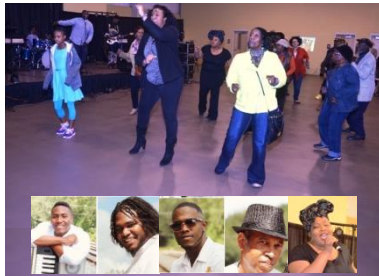
Smooth & The Groove Band Sparks Impromptu Dance by Guests