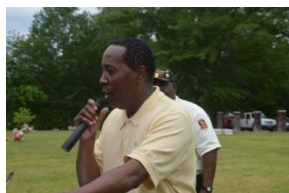
SC Senator Darrell Jackson