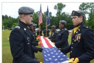
JROTC Cadets, Lower Richland High School