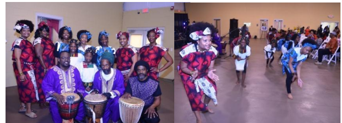
Abatsu African Drummers and Dancers from Augusta, GA