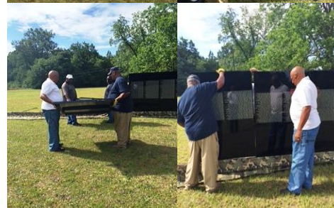
Innovators of North & South Carolina RV Club