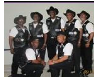
The Beulah Boys of Atlanta, GA