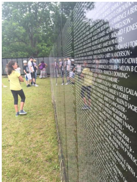
THE MOVING WALL™ The Traveling Replica of the Vietnam Veterans National Memorial