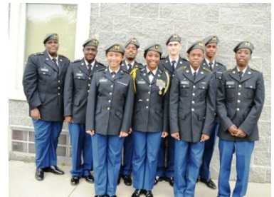
LRHS JROTC Cadets