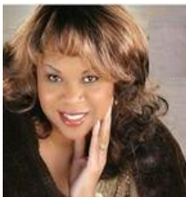
Deniece Williams 4 time Grammy Award Winning Singer