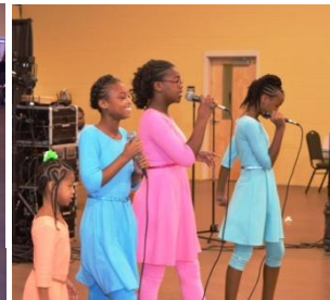
Melodic Hearts Spartanburg, SC