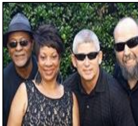
Blues Box 50