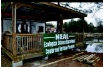
3rd Stop - Neal Ecological & Heritage Preserve