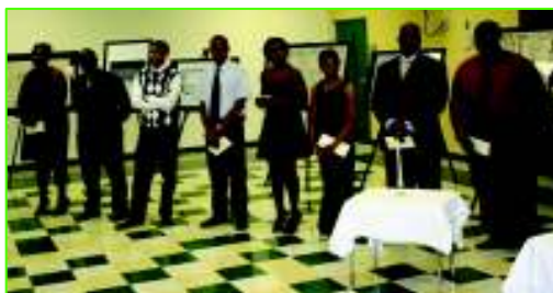
8 of 21 Scholarship Recipients - 2010