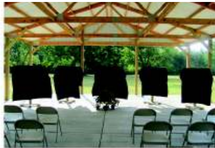
Ceremonial Historical Markers Await Unveiling