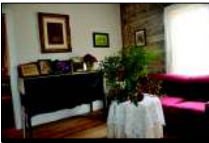
Departure - The Harriet Barber House