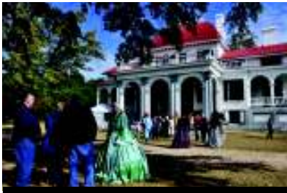
1st Stop - Kensington Mansion