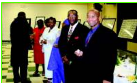
Class of 1970