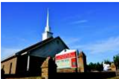
2nd Stop - Antioch AME Zion Church