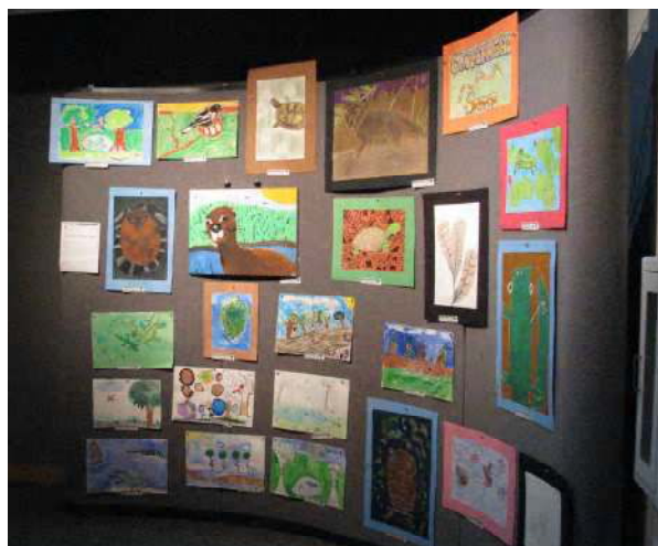
Midlands Student (K-8) Art Contest Winners & Honorable Mentions