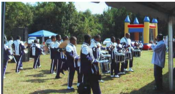
Benedict College Drumline