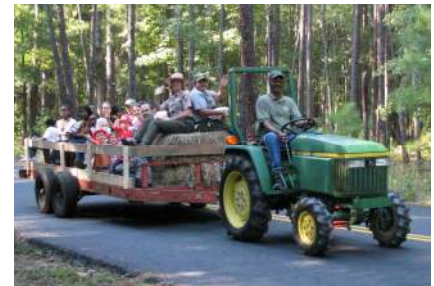
Hay Ride Tour Congaree Swamp