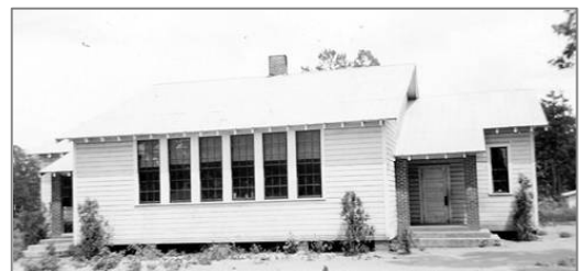
Early African American Schools St. Phillip’s ~ Eastover, SC