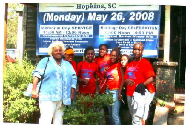
Top Teens of the Midlands & Advisor 2008 Memorial Day Celebration