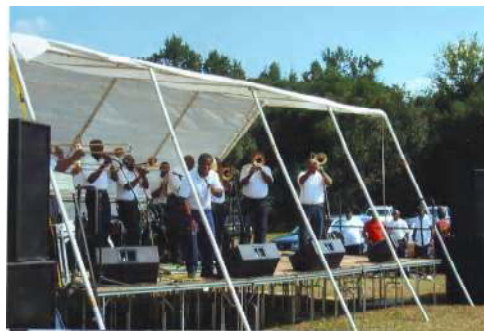
The Madison Bumblebees Winsboro, SC