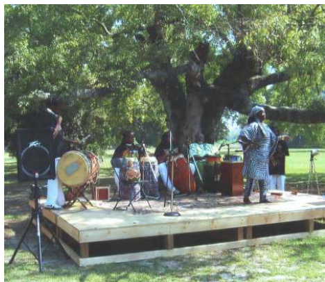
Egbe Killamanjaro African Drumming and Dance Group Perform - Harriet Barber House