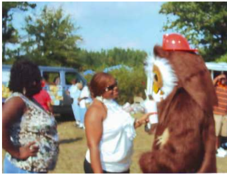
Congaree National Park Mascot Greets Visitors

Sixth Annual Swamp Fest: Friday and Saturday, October 3-4, 2008