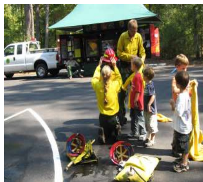
Park Fire Safety Demo