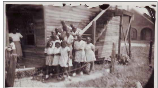
Where is this location ?