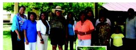
Expressive Arts Camp