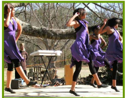
Clafin University Dance Group "PULSE"