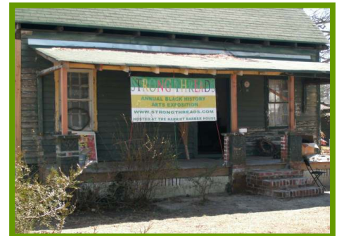
Historical Harriet Barber House