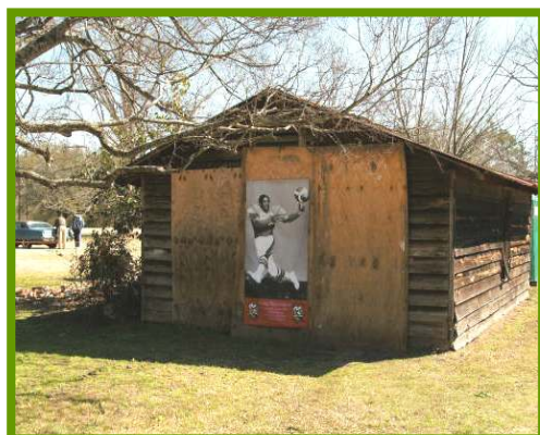
Poster of Eugene Washington, Former NFL Player and UGA Hall of Fame Inductee