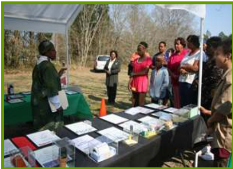
Exhibit of Inventions by African Americans