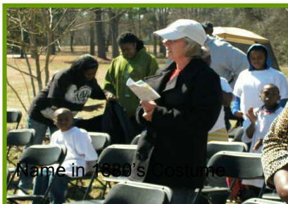
Georgetown Guests and Locals Gather Near Stage