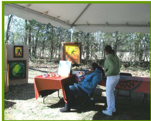
Juried Artists, Painters and Crafters on Display