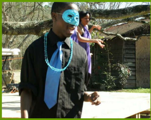
Clafin University Dance Group "PULSE"