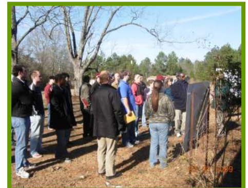
USC Students and SERCO Members Depart on Tour