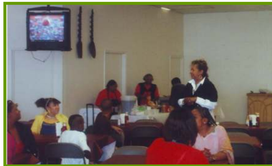
Students Enjoy Traditional Barbeque Lunch at Big T's