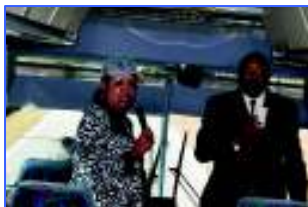
Bus Tour – Off to Historical Sites in Lower Richland Heritage Corridor