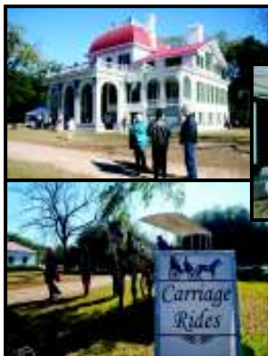
Kensington Mansion Eastover, SC