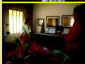
Historic Harriet Barber House Hopkins, SC