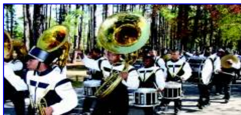
Lower Richland High School Marching Band