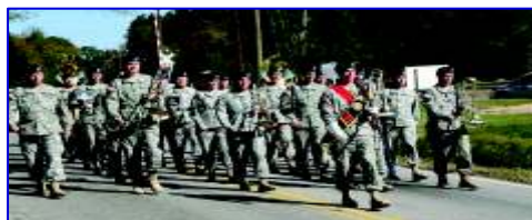
Fort Jackson Army Band