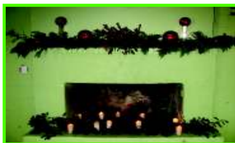
"The Old Hearth" - LR Heritage Museum Historic Village of Hopkins