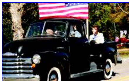
Antique truck: Team 1 Automotive