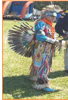
Sumter Tribe of Cheraw Indians