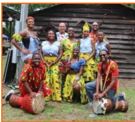
Cultural Expressions Drummers & Dancers