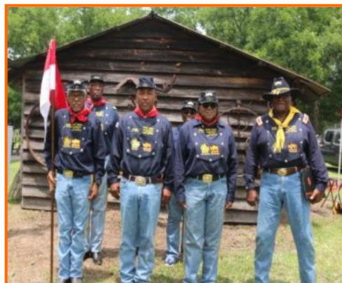
Buffalo Soldiers: Midlands Chapter 9 & 10