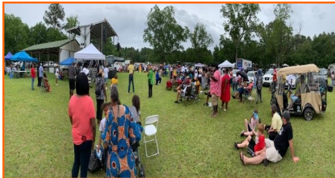
Families Celebrating Togetherness