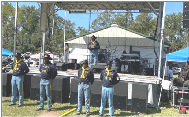
Buffalo Soldiers Midlands Chapters 9 & 10