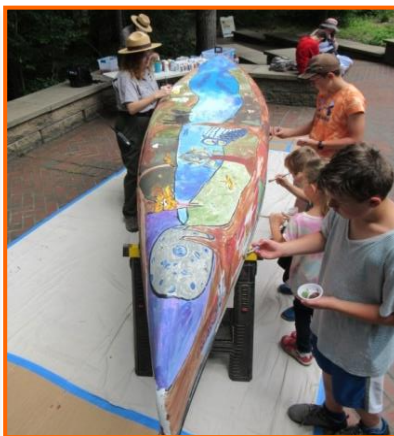
Assisted by Park Rangers, youth decorated an old canoe using paint