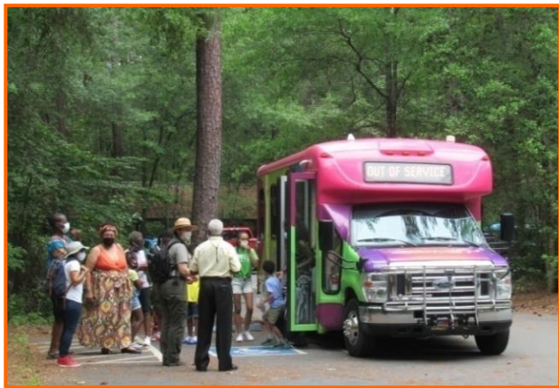
The COMET: Central Midlands Regional Transit Authority provided a shuttle to the Congaree National Park.