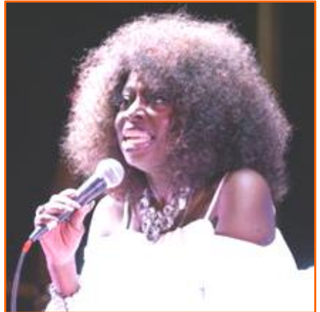
National Recording Artist Angie Stone (Columbia, SC Native)