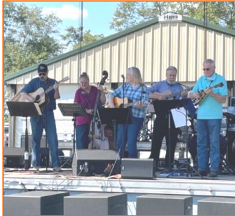
Saluda River Band