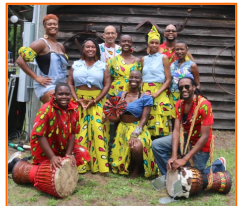
Cultural Expressions Drummers & Dancers