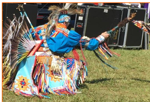
Sumter Tribe of Cheraw Indians