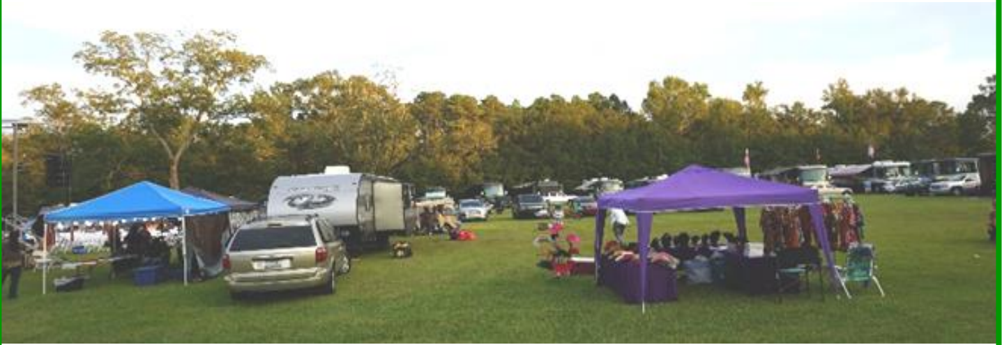
65 RVs Camped for the Event