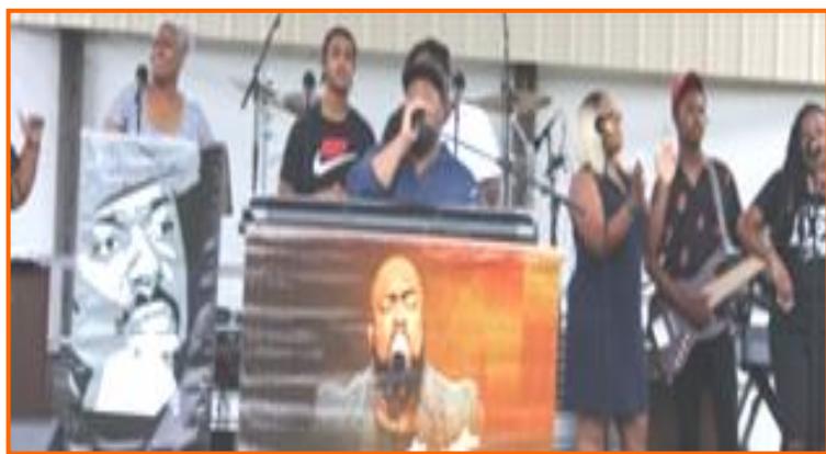
Headliner: Rev. John P. Kee

Held on the grounds of the Historic Harriet Barber House, Hopkins, SC